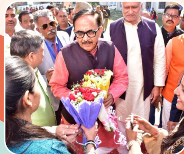
Sh. Mahendra Nath Pandey (Hon'ble Union Minister, Govt. of India)