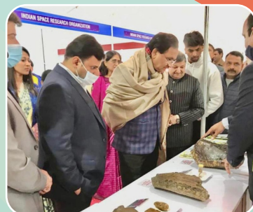
Sh. Bhagwanth Khuba (Hon'ble Union Minister of State, Govt. of India)