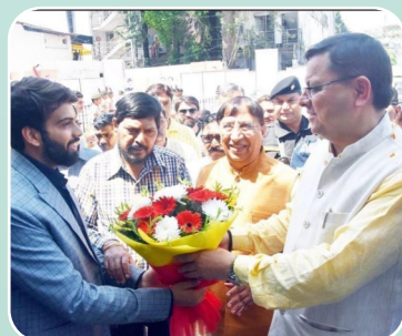
Sh. Pushkar Singh Dhami (Chief Minister of Uttarakhand)