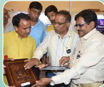
Sh. Dhan Singh Rawat (Hon'ble Union Minister, Govt. of Uttarakhand)