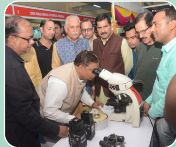
Sh. Shamsheer Singh Manhas (Hon'ble Member of Parliament, Govt. of India)