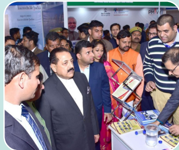
Dr. Jitendra Singh (Hon'ble Union Minister of State (I/C), PMO) Govt. of India