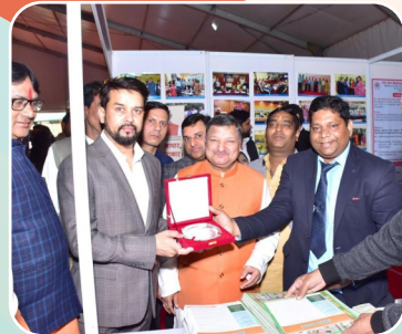
Sh. Anurag Thakur (Hon'ble Union Minister, Govt. of India)