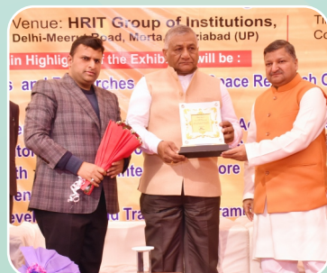
General Vijay Kumar Singh PVSM, AVSM, YSM, ADC (Hon'ble Union Minister of State, Govt. of India)