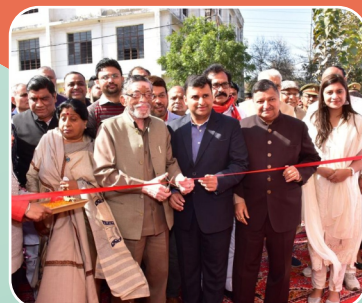
Sh. Santosh Gangwar (Hon'ble Union Minister, Govt. of India)