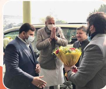
Sh. Parshottam Rupala (Hon'ble Union Minister, Govt. of India)