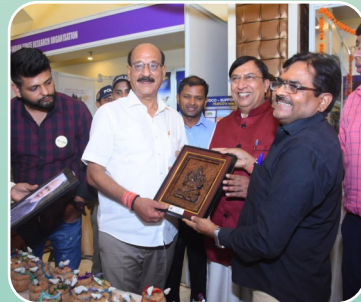
Sh. Subodh Uniyal (Hon'ble Union Minister, Govt. of Uttarakhand)